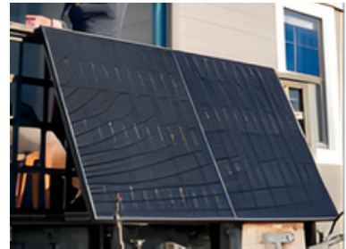
Plug-in solar array (Bright Saver)

Plug-in solar is the affordable, clean energy source Maine needs to expand clean energy access, lower electricity bills, and strengthen communities' climate resilience.