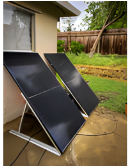
Plug-in solar array (Bright Saver)

Expand access to solar energy. Lower prices and fight climate change.